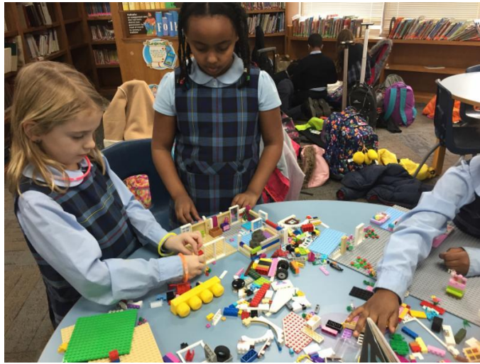
Building with Legos