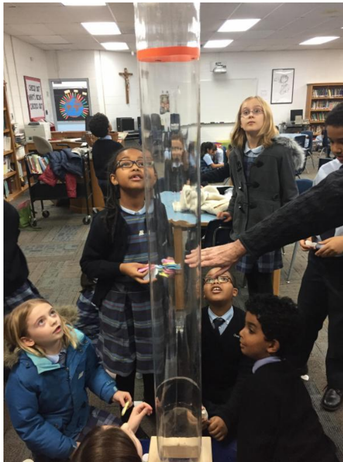
Using the wind tunnel