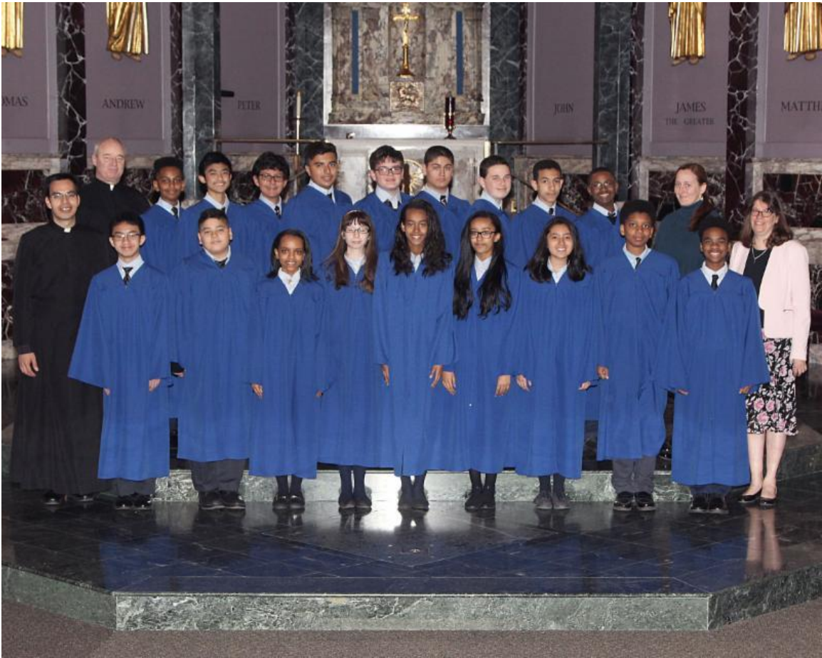
8th grade Graduating Class 2017