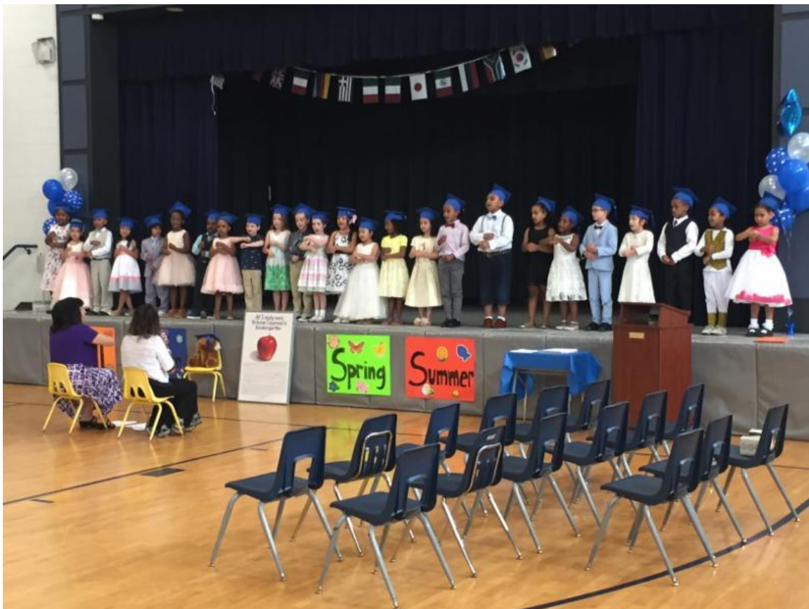
Kindergarten Graduation 2017