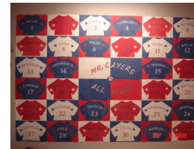
Hallway Bulletin Board