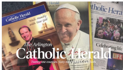
Arlington Catholic Herald