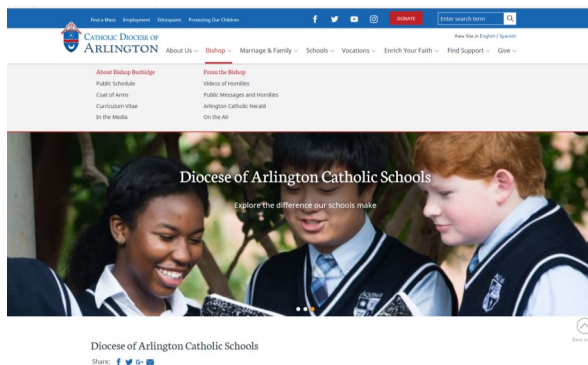
Official Diocesan/School Media